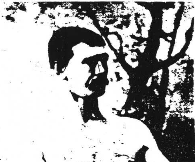
Gladiators Of The Prize Ring -- 1895